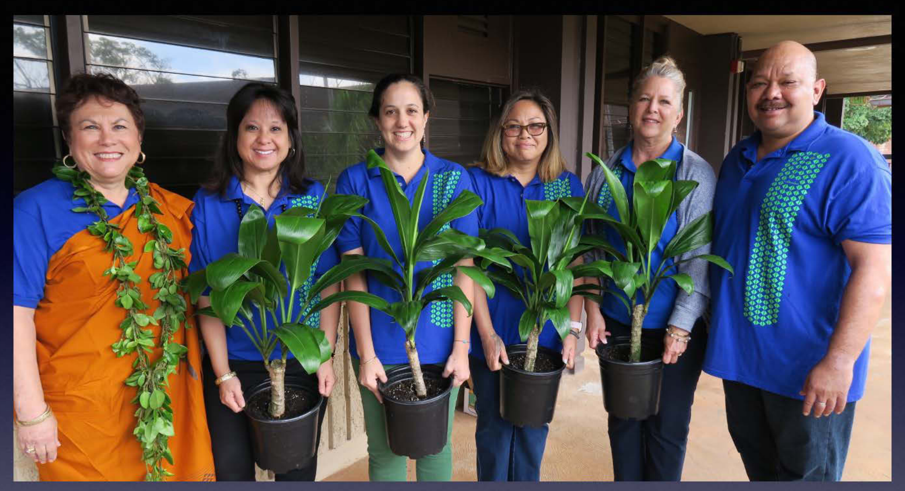
Hawaiian Protocol Openings - Blessings Kīkaha o Laeʻahi, 10 February 2017 Waikīkī School Mindful Learning Center, 24 February 2017 Association of Community College Trustees Governance Leadership Institute - 'Ōhi'a - 31 March 2017