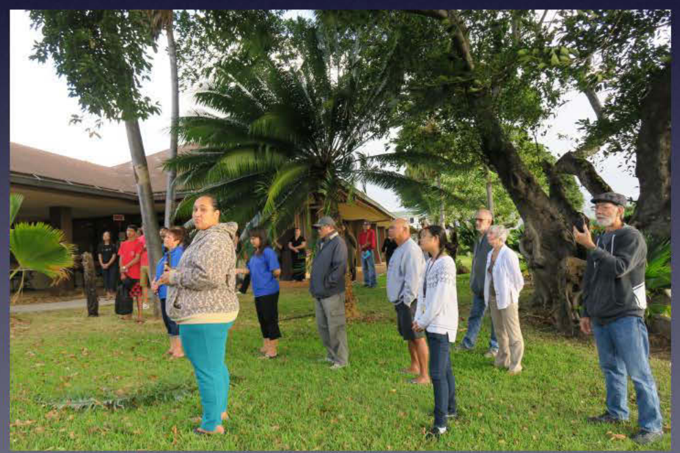
Lā Kū'oko'a - Kalaunu o Hawai'i - 28 November 2016