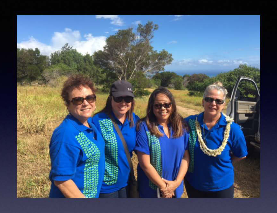
Hawai'i Papa O Ke Ao Leadership Training Palehua - 21 October 2016