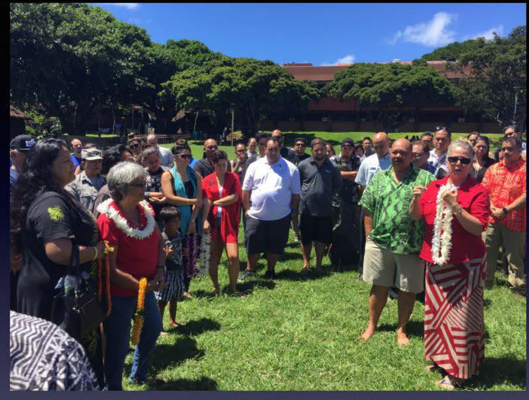
Kākoʻo Cruz 22 September 2016