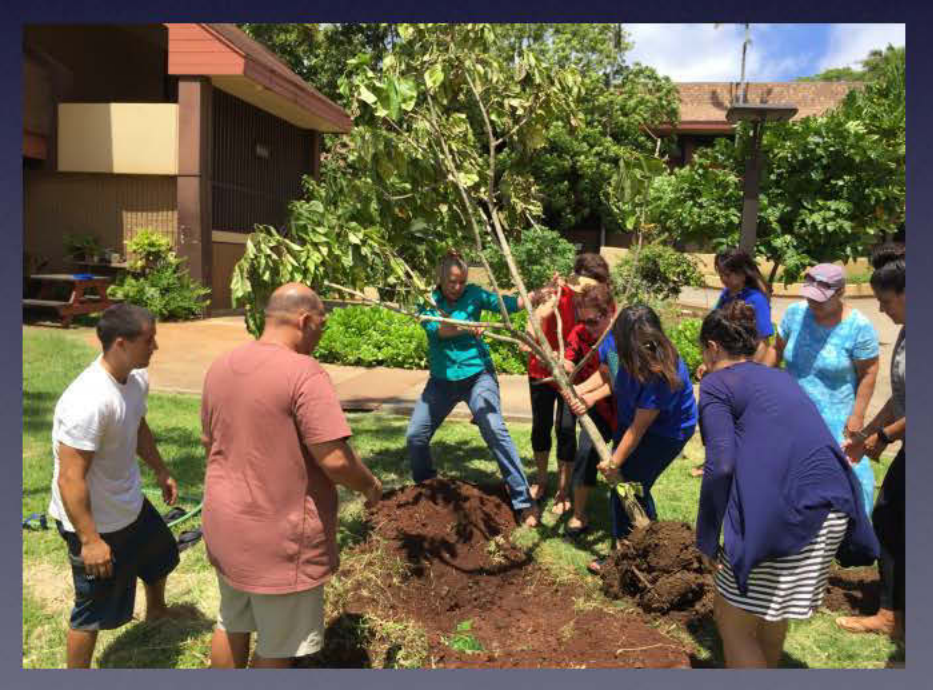
Kou Planting - 12 August 2016