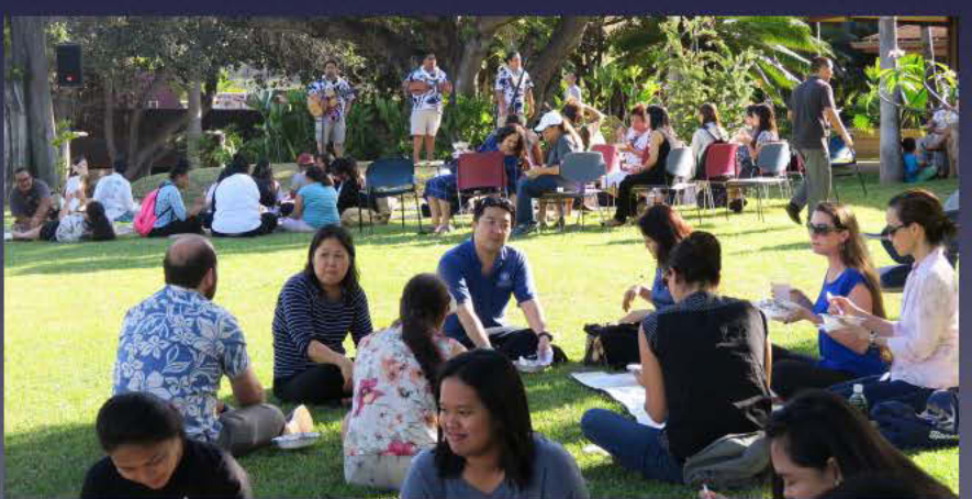
Ke Kahua Malí'o 26 Apríl 2017