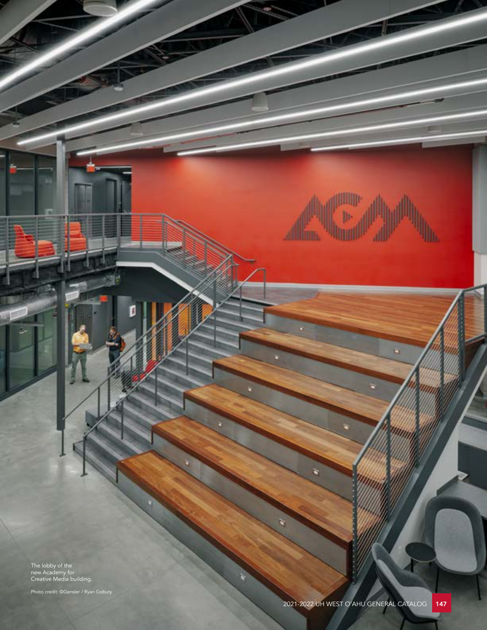
The lobby of the new Academy for Creative Media building.