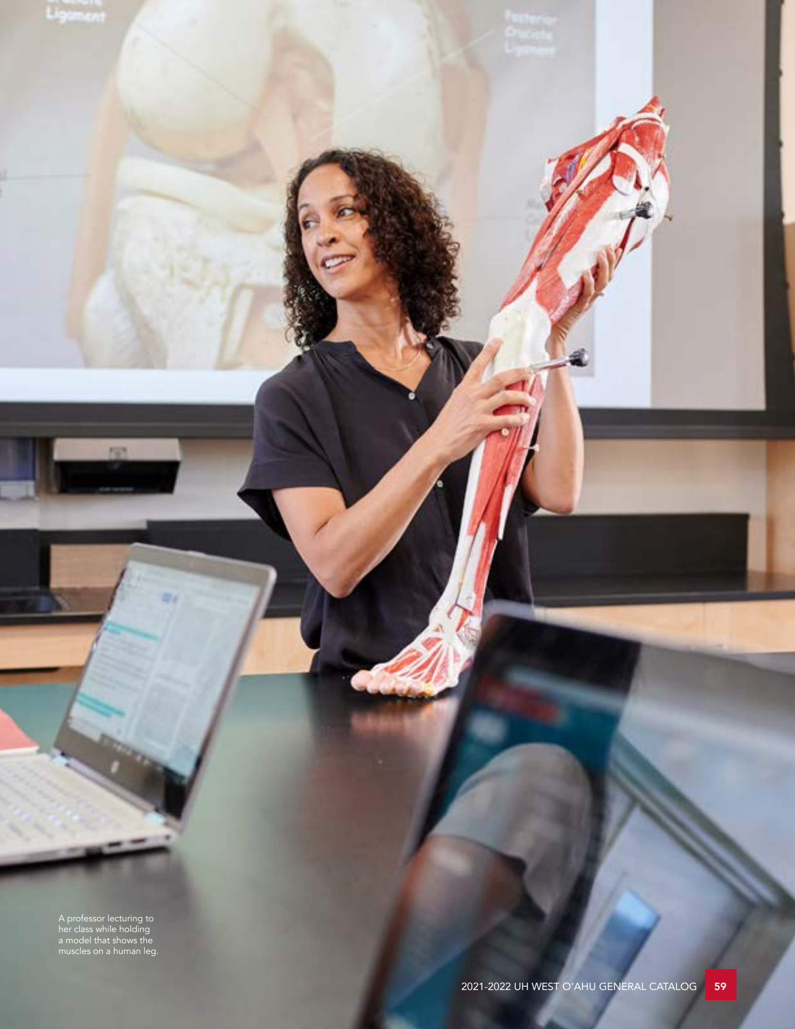
A professor lecturing to her class while holding a model that shows the muscles on a human leg.