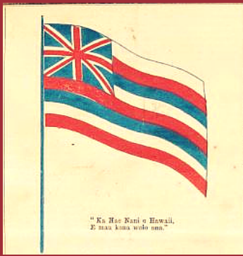
"Ka Hae Nani o Hawaii, E mau kona welo ana." Ka Nupepa Kuokoa. 1862